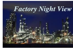
Factory Night View