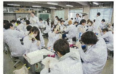
Students at Biochemistry Laboratory

If you are a medical student and interested in coming to SMU for a learning experience either in Basic Medical Sciences or Clinical Sciences, please email us. For formal application, a resume, a letter of recommendation from the Dean of your medical school, a health certificate (including your immunization record), and some additional documents are necessary. Please contact us at: